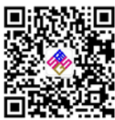
GS WeChat 研究生院微信