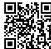
Official Website 課程網址