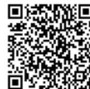
Online Application 網上申請

* The Programme Office reserves the right to change the application closing date without prior notice. 課程辦公室有權更改申請截止日期而不作另行通知。