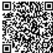
Online Application 網上申請