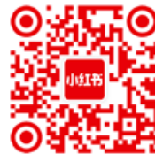
GS Rednote 研究生院小紅書